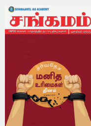
TNPSC Current Affairs SANGAMAM