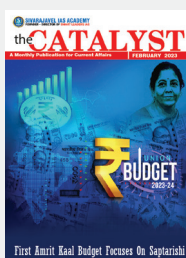
UPSC Current Affairs THE CATALYST