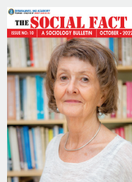
Sociology Current Affairs THE SOCIAL FACT