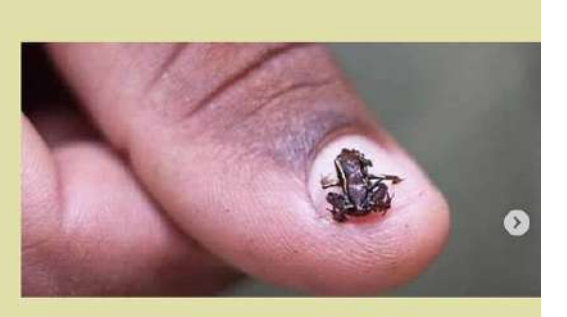
At 7mm (0.27 inches) long, Paedophryne amauensis may be the world's smallest vertebrate - the group that includes mammals, fish, birds and amphibians.